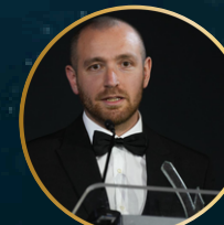
FGURA UNITED F.C.