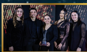
WOMEN'S NATIONAL FOOTBALL TEAM