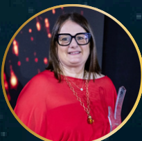
GAMES FOR SMALL STATES OF EUROPE GSSE 2023