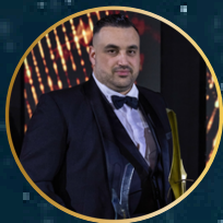
CLAYTON CASTALDI POOL